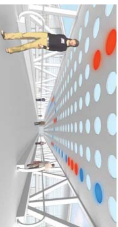
Connections by Electroland

The baggage screening and handling system at IND is state-of-the-art. Passenger luggage checked at curbside check-in stations goes directly into the system, where it is screened and then loaded on planes. Luggage from arriving flights takes two minutes or less to travel from baggage handling area to the Arrivals Level carousels.