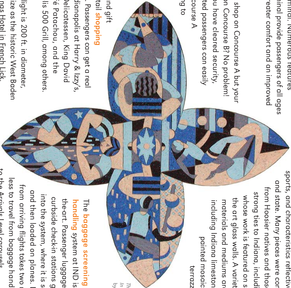
The Glory of Sports In Indianapolis by Tom Torluemeke

in Civic Plaza is an energy-efficient radiant heating and cooling system.